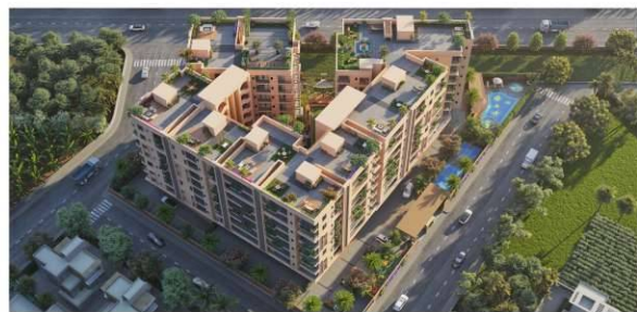
IMPERIAL GARDEN Vidhyadhar Nagar, Jaipur