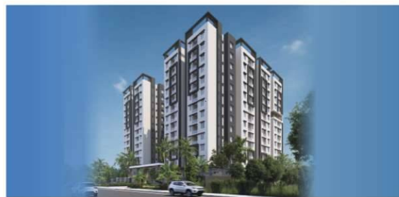
IMPERIAL UTSAV Road No. 14, Sikar Road, Jaipur