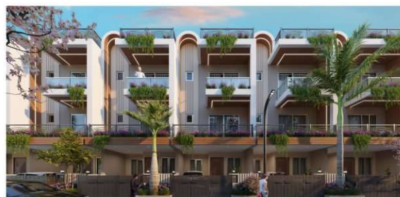
IMPERIAL Ville Gandhipath West, Vaishali Nagar, Jaipur