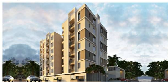
KRISHNA RESIDENCY Bhankrota, Sirsi Road, Jaipur